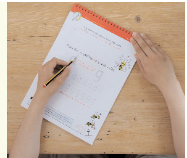
The three full-colour books are spiral bound at the top of the page for ease of use for left-handers, and include useful help throughout on the most effective position and grip.

The authors are highly experienced in helping left-handed children, and run specialist teacher training courses, "Left-Handed Children – The Right Way to help!" in schools, LEA centres and other educational establishments. Their training guidelines have been endorsed by the DfES in the UK and incorporated into the National Literacy Strategy.